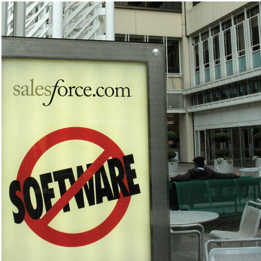
Salesforce marketing campaign.

Before computers came on the scene in the mid-1950s, the most advanced information processing equipment that organizations could buy (or lease) was punched-card electric accounting machines, or EAMs. The main vendor of this type of equipment, IBM, opened the first of several service bureaus in 1932. Customers brought their data processing needs to a bureau and came